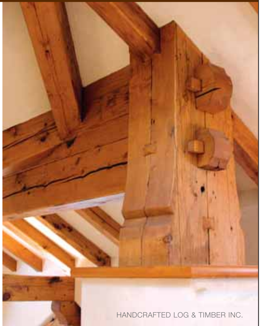
HANDCRAFTED LOG & TIMBER INC.

Griffeth Structural, LLC 1918 Connecticut Dr. Fort Collins, CO 80525 970-223-5491 griffethstructural.com