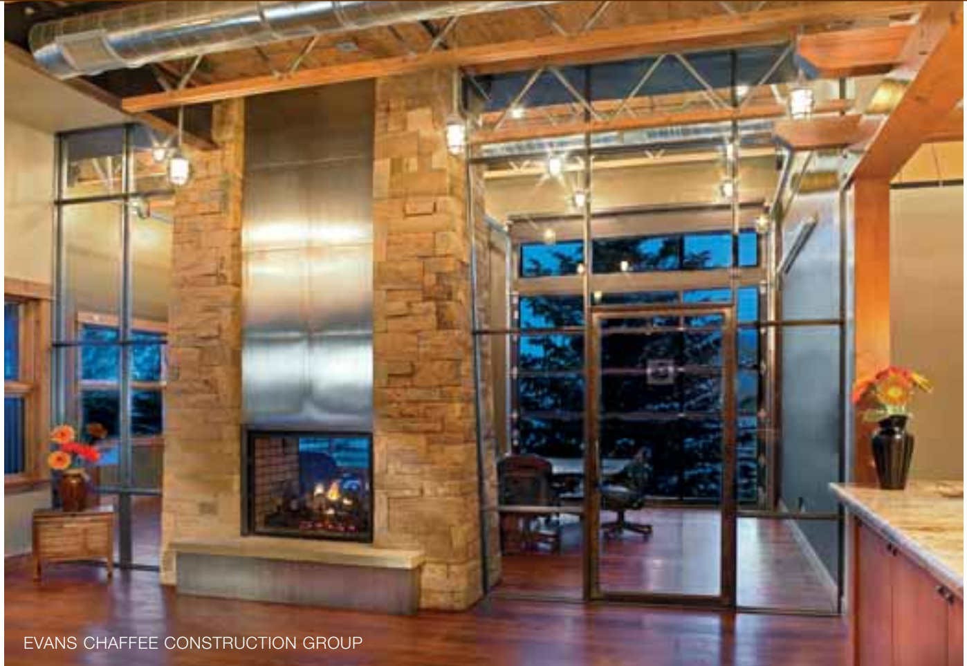
EVANS CHAFFEE CONSTRUCTION GROUP