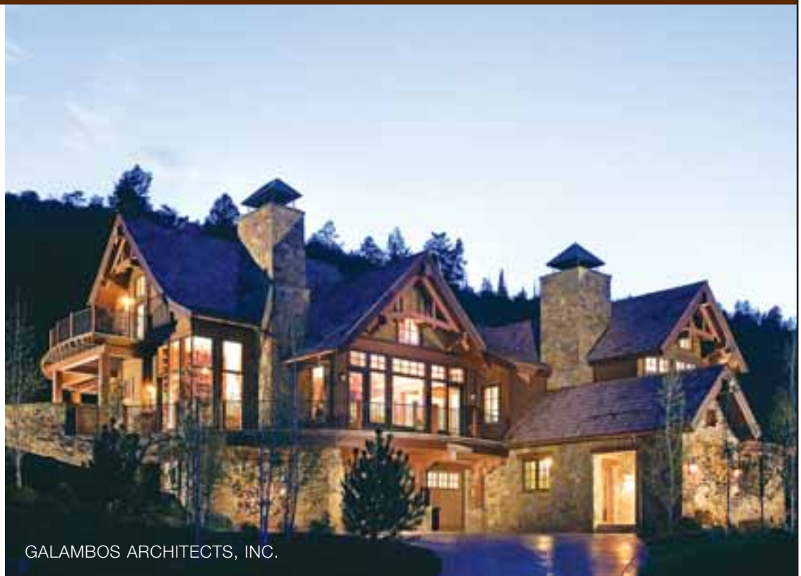
GALAMBOS ARCHITECTS, INC.

TKP Architects, P.C. 1509 Washington Ave. Golden, CO 80401 303-278-3840 see ● tkparch.com